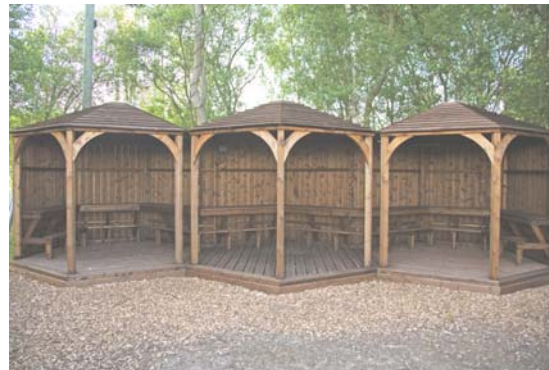
The village in the woods

Please note that we cannot be responsible for the care of any children and parents should be responsible for their own children at all times. There is a Crèche area (unsupervised) available for use by parents (5 on map).