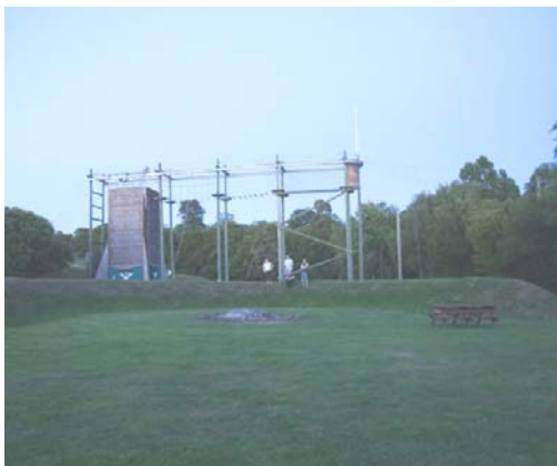
High Ropes course behind the bonfire amphitheatre

Picture on front page. Main marquee and football cage.